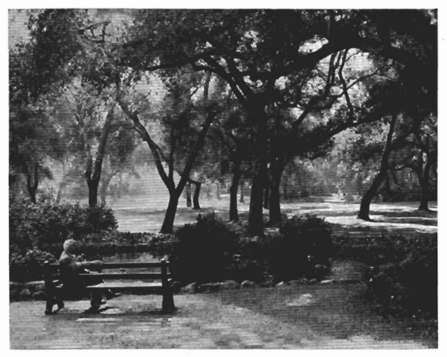
One of many beautiful spots in Descanso Gardens.

There are many educational programs in gardening for adults and children at Descanso. Also, there is a gardening class for handicapped children. In cooperation with the school districts of California, conducted tours through the gardens and the nature trails are led by the tour guides. The gardens are also available for other educational and cultural events.